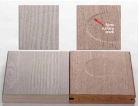
Clubhouse Competitive Cellular PVC Decking

Laboratory impact tests* prove that Clubhouse Decking with Korelite technology has better impact resistance.